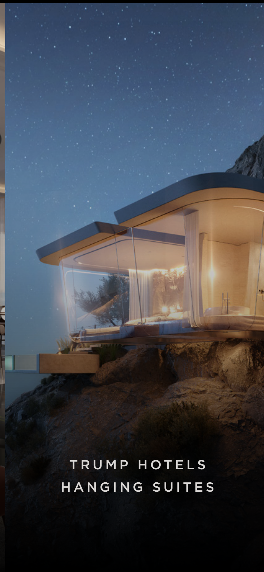
TRUMP HOTELS HANGING SUITES