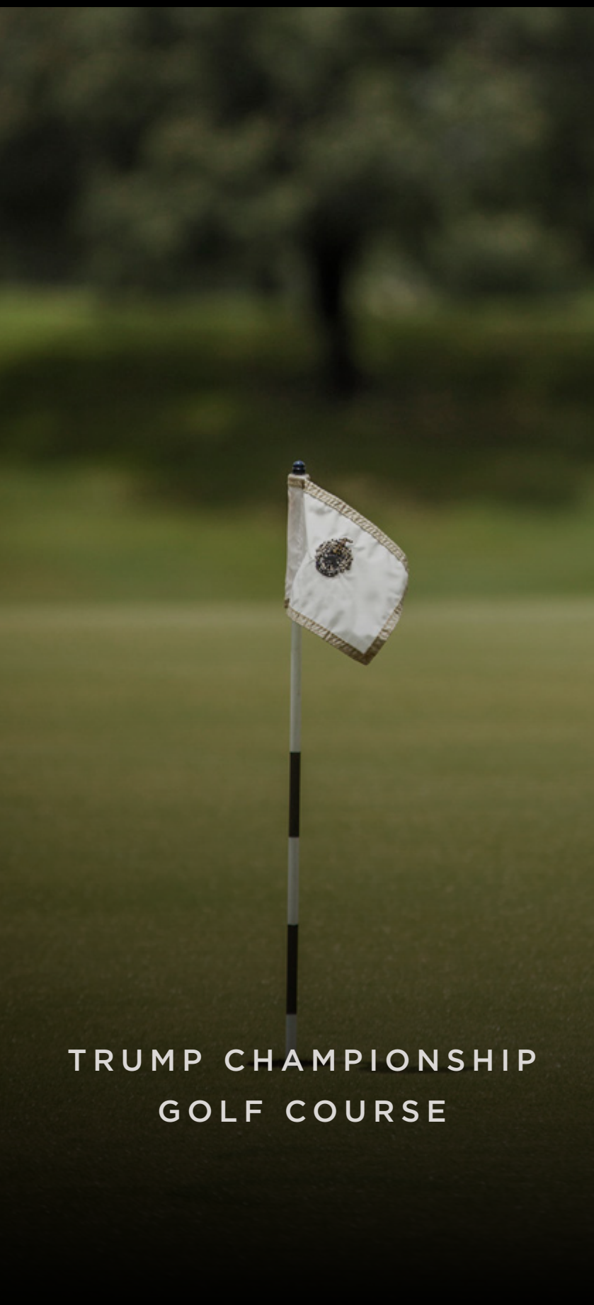
TRUMP CHAMPIONSHIP GOLF COURSE

MINUTES AWAY FROM UNPARALLELED AMENITIES