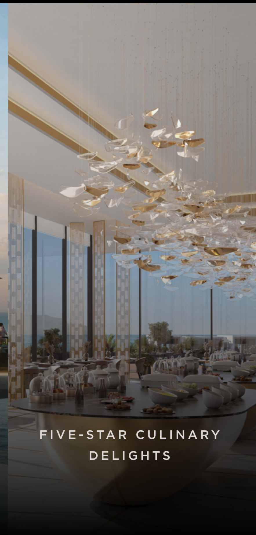
FIVE-STAR CULINARY DELIGHTS