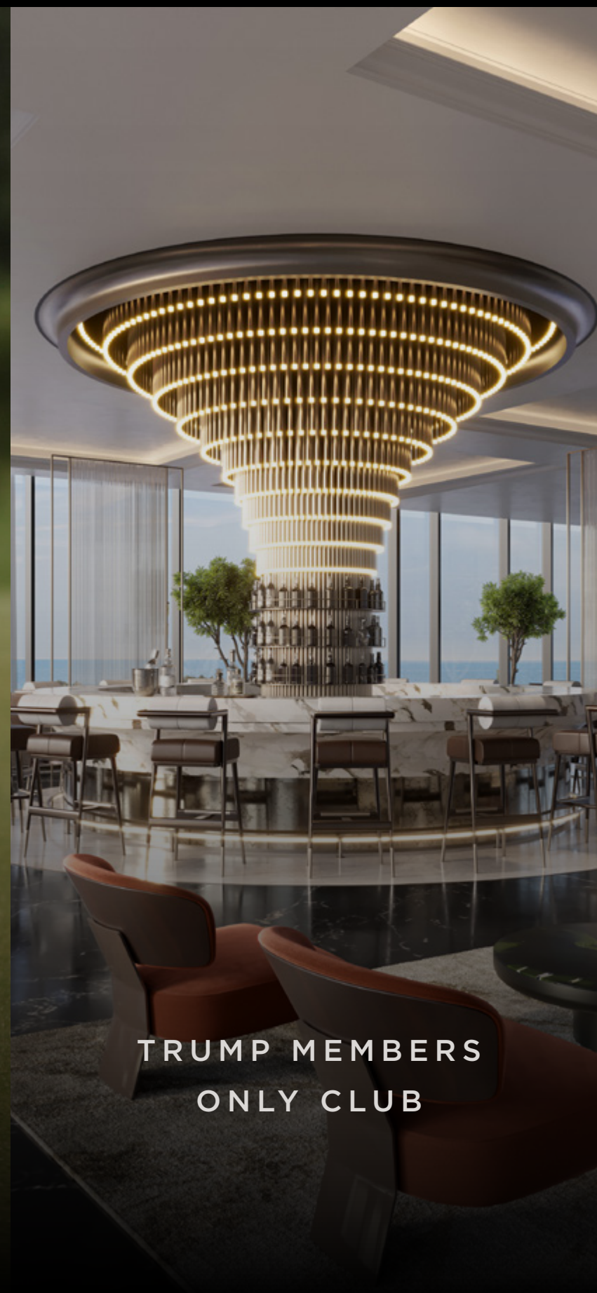
TRUMP MEMBERS ONLY CLUB